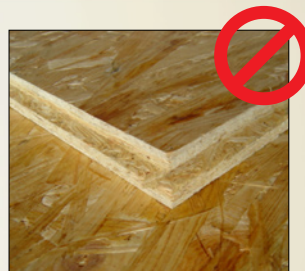
Oriented Strand Board (OSB)

We invite you to contact us with any questions regarding the details of your next construction project. Let us show you how the experience and commitment to quality of Riley Palmer Construction Company can make a difference.